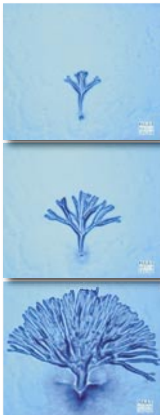
Stills from Allomyces: Dichotomous branching, from the IWF collection.

EDINA is also currently working with subject specialists to investigate current and potential use of the films and videos in EMOL in teaching.