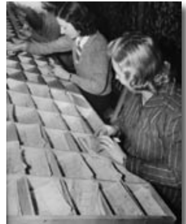
It's easy to sort your images using My Albums in EIG. (Image: Big Brother © Getty Images)

If you have any queries about My Albums or any aspect of the EIG service, please contact the Helpdesk: edina@ed.ac.uk or telephone 0131-650 3302.