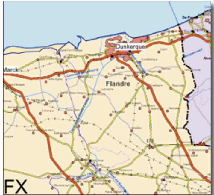
Visualisation of EuroGlobalMap data including Dunkerque and environs

EuroGeographics http://www.eurogeographics.org International Steering Committee for Global Mapping http://www.iscgm.org