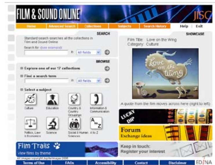
Work in progress: a prototype of the new user interface