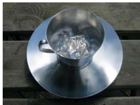
Terraincup: 3D Ben Nevis in a cup. Practice-based research project focused on developing a method for the physical manufacture of 3D objects with terrain based modelling elements.