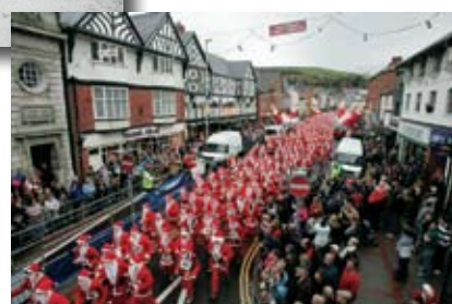
Santa Fun Run Held In Newtown