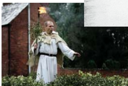
Christmas Mistletoe Blessed In Druid Ceremony